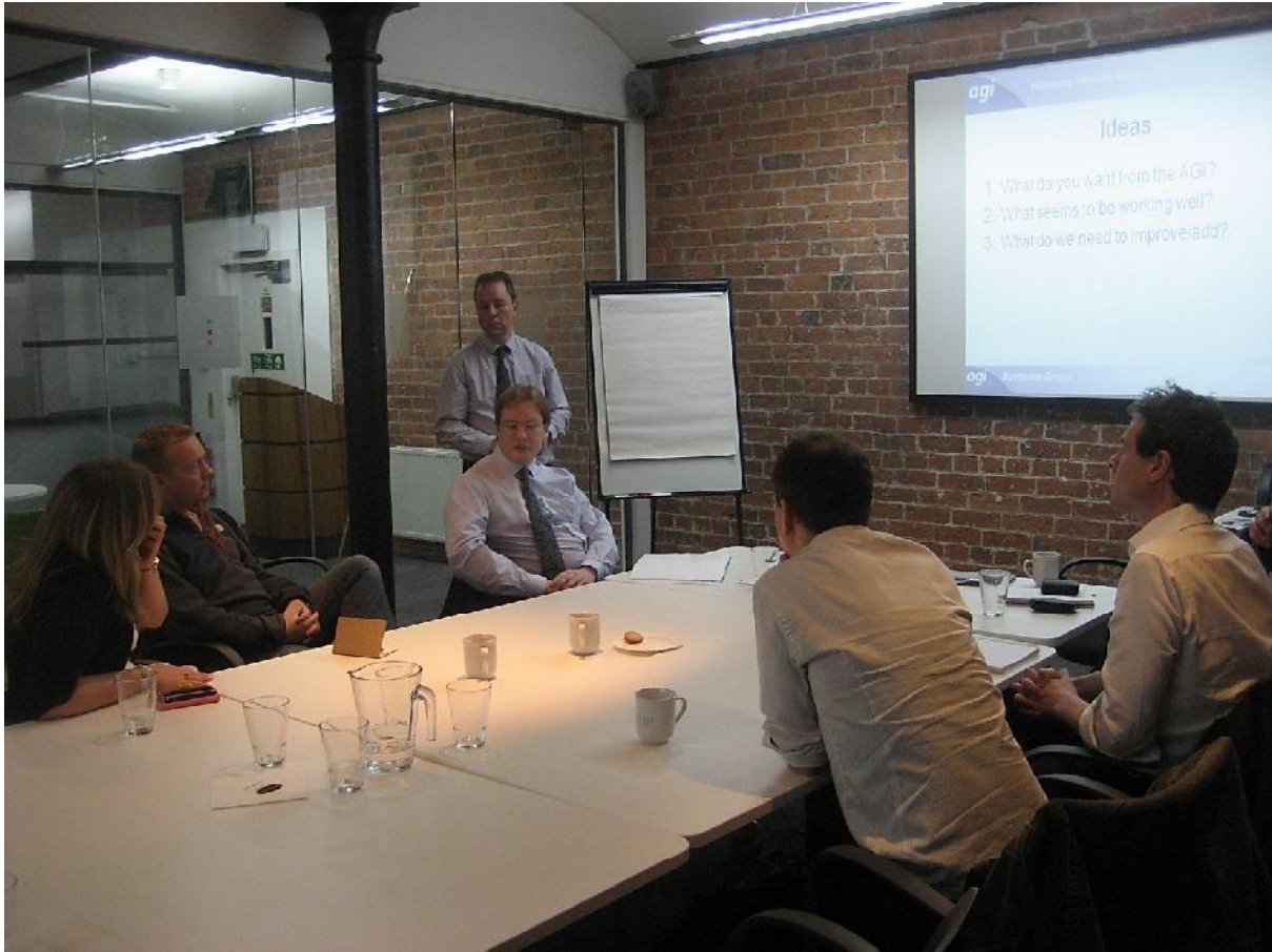
Figure 2 – Group 1 breaking out the ideas